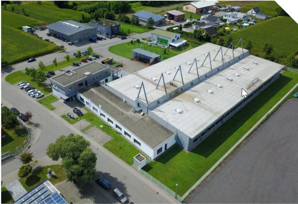
Kippenheim: 3.300 m 2 production space 700 m 2 office space Wear Parts and Solutions