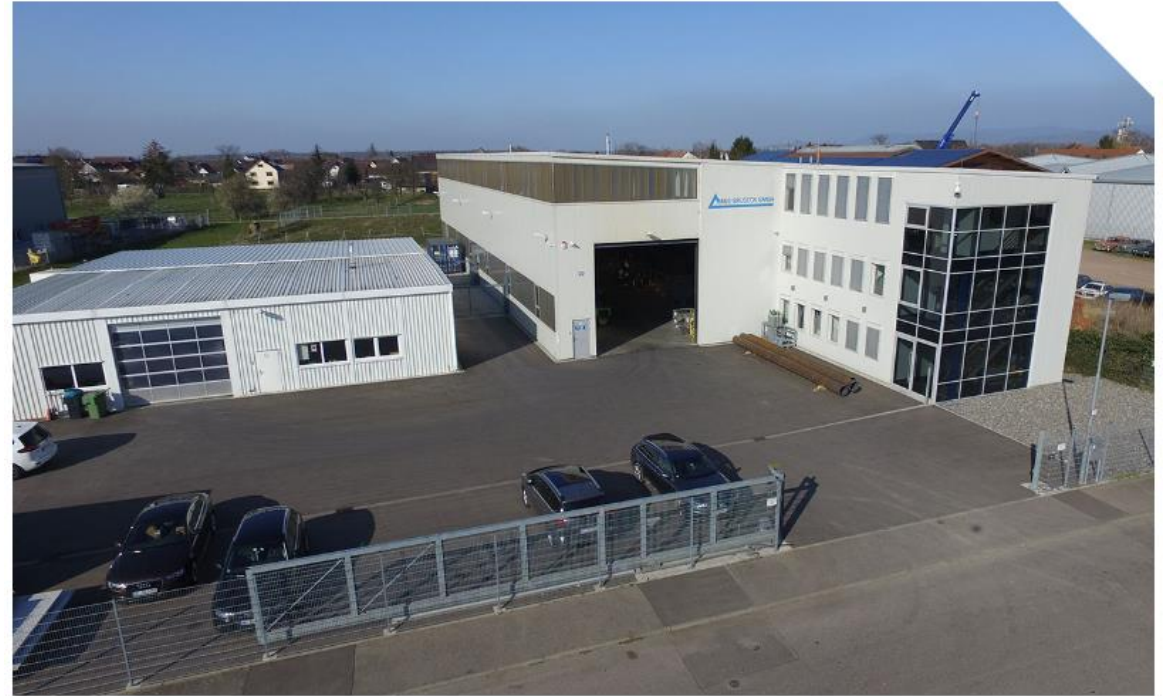
Grafenhausen: 1.500 m 2 production space Systems Technology